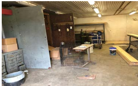
0542 – Storage Building