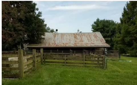
0540A – Hog Feed Shed