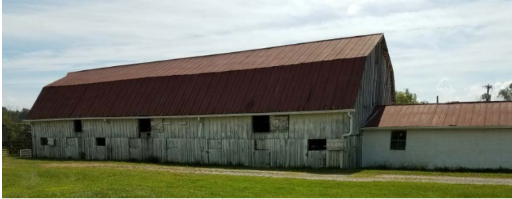
0479B – Aluminum Sheet Feeder Barn