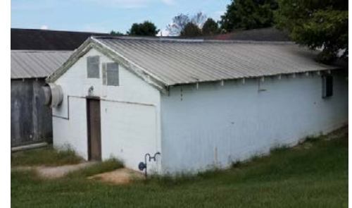
0543 – Metabolism Building