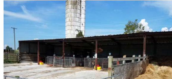
0480 – Feeder Pen