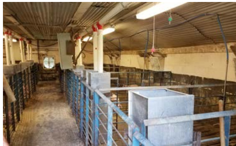
0540A – Hog Feed Shed