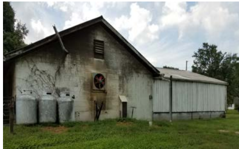
0542 – Storage Building