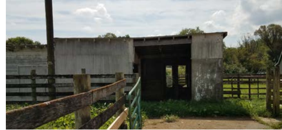
0479D – Barn