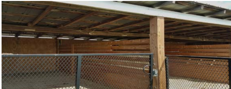
0479B – Aluminum Sheet Feeder Barn