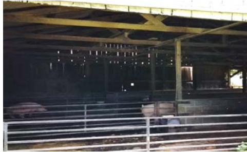
0540 – Hog Barn