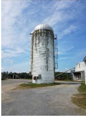
0550A - Silos