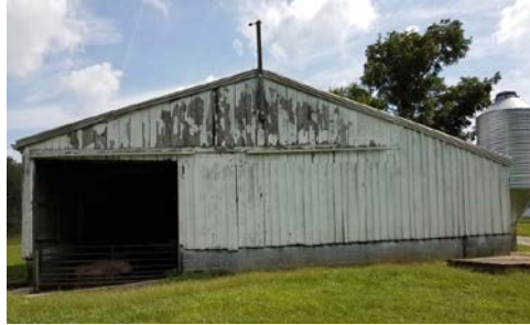
0540 – Hog Barn