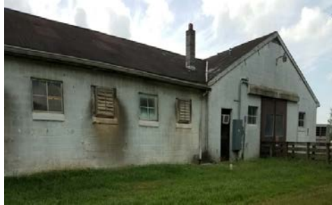
0541 – Swine Center Building