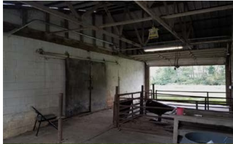
0541 – Swine Center Building