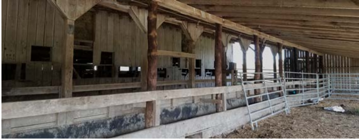
0479B – Aluminum Sheet Feeder Barn