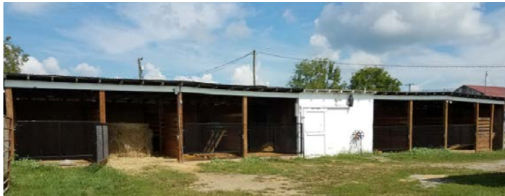
0479B – Aluminum Sheet Feeder Barn