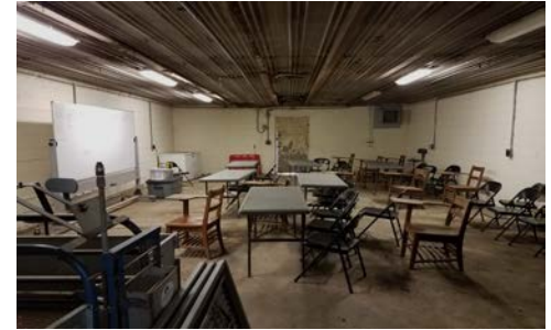
0543 – Metabolism Building